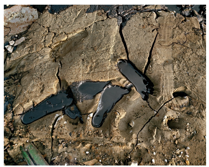
Edward Burtynsky, Shipbreaking #10, Chittagong, Bangladesh, 2000^4

The Chittagong shipbreaking yards, despite court cases and public outcry, are still one of the most dangerous workplaces in the world.<sup>5</sup> According to Human Rights Watch, an "entire industry exists to enable shipowners to circumvent international regulations so that shipping companies can continue to cheaply discard ships in Bangladesh's dangerous yards."<sup>6</sup> That same report noted that Bangladeshi shipbreaking yards often take shortcuts on safety measures, dump toxic waste into the surrounding environment, and deny workers living wages. Bangladesh's labor laws go unenforced. In fact, a 2019 survey of shipbreaking workers estimated that thirteen percent of the workforce are children.<sup>7</sup>