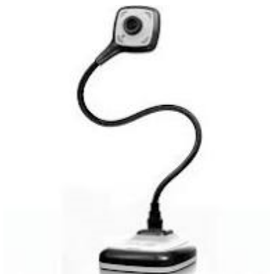
Fig. 3. HUE Camera from Amazon.

As jury trials continue remotely due to COVID-19 restrictions, the point is this: though there are obstacles to remote witness testimony, there are remedies to effectuate remote proceedings.